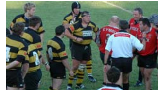
Who said it was a friendly?