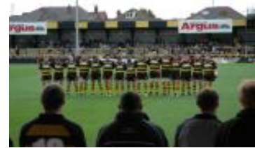
Newport RFC observe one minutes silence