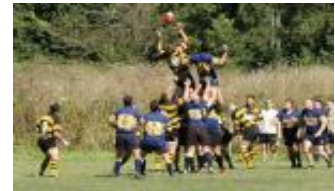
The lineout works well!

This fixture gave Newport the opportunity to go through the routines. 10 tries and 10 conversions too numerous to detail. Not a bad afternoons entertainment!